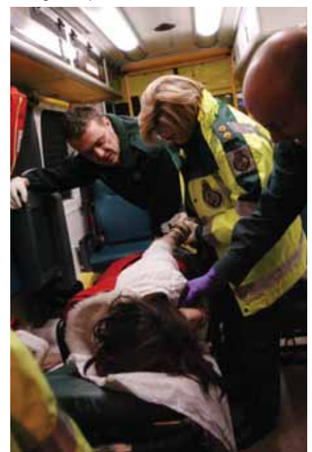
Caring for a patient aboard the 'Booze Bus'

This year we opened four such stations in Hillingdon, Bromley, Deptford and Thornton Heath.