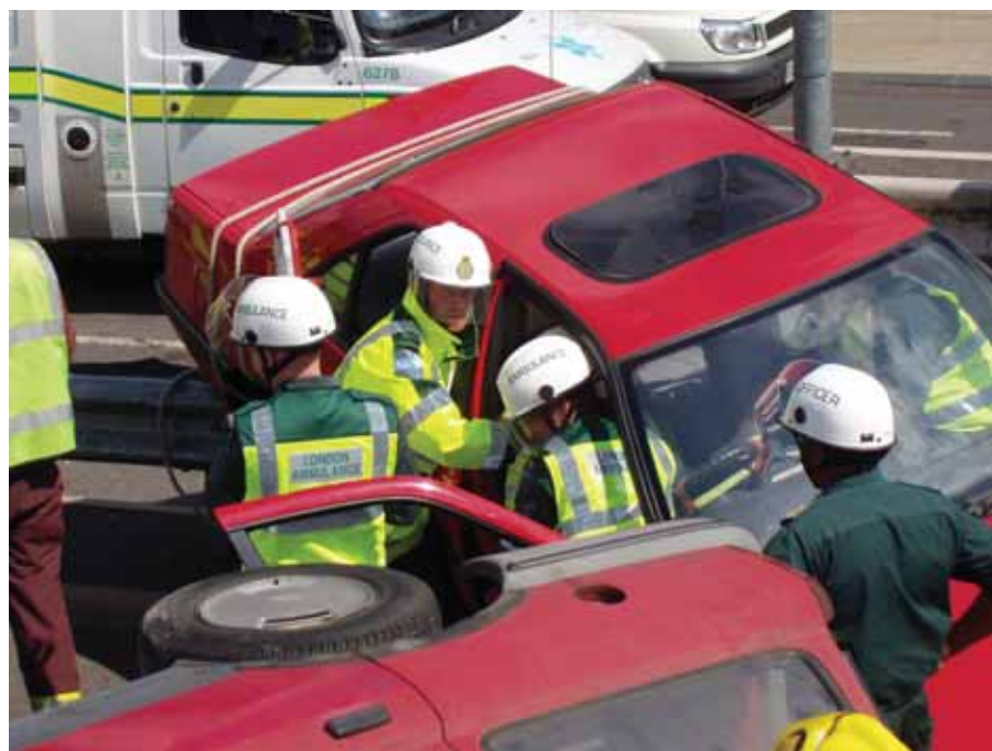
New recruits practice their response to road traffic accidents at a training event

Since the introduction of our new diversity training course, over 590 members of staff have undertaken this session as part of the Continuing Professional Development course. It covers gender, disability, mental health, religion/belief and sexual orientation issues, as well as the general duties under the Race Relations Act. In addition, all new operational crews receive a two to four hour session on diversity issues during their foundation training and all other new members of staff receive a one-hour 'Managing Diversity' session as part of the