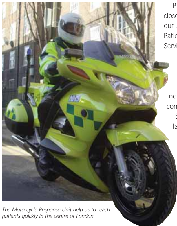
The Motorcycle Response Unit help us to reach patients quickly in the centre of London

Farm and Barnet Hospitals. We have learnt valuable lessons from this and are reviewing the way we tender for new or existing business.