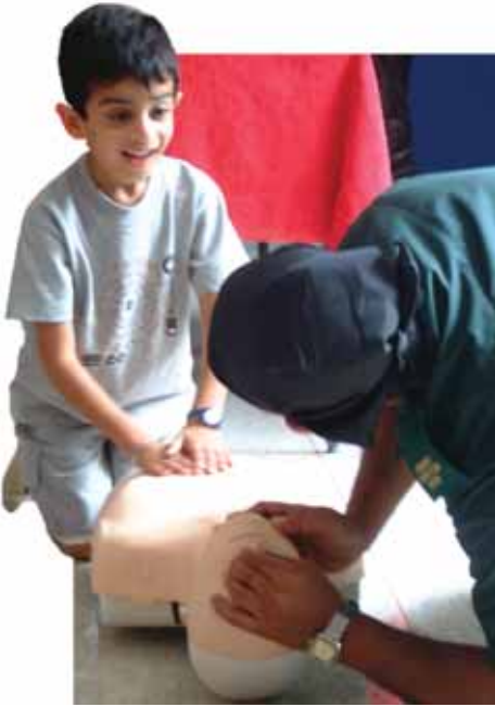
Delivering CPR training at the Brent Sikh Centre