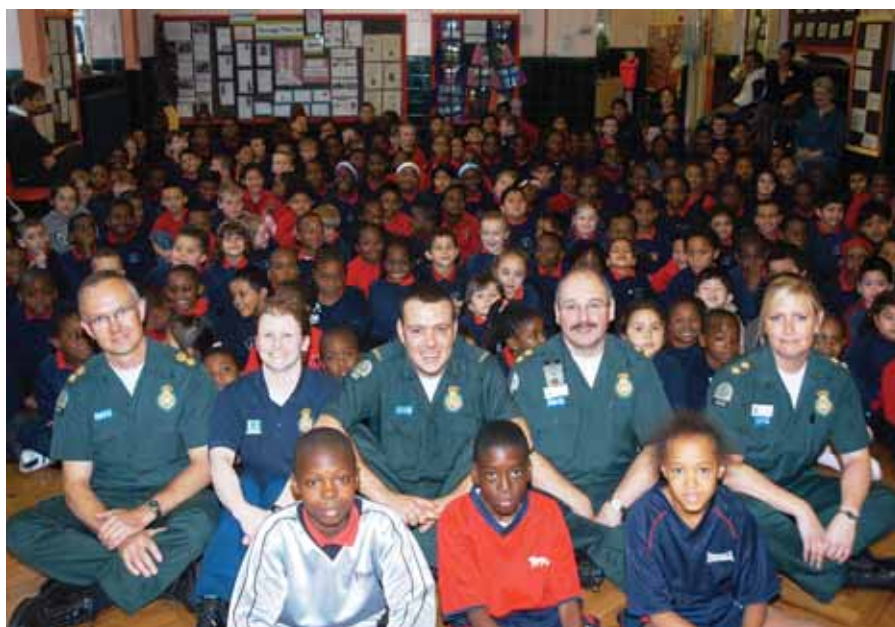
Visiting the children at Victory Primary School in Southwark

We have also produced 'Save a Life' cards in four South Asian languages. These describe how to carry out CPR and aim to raise awareness of the increased risk of coronary heart disease amongst people