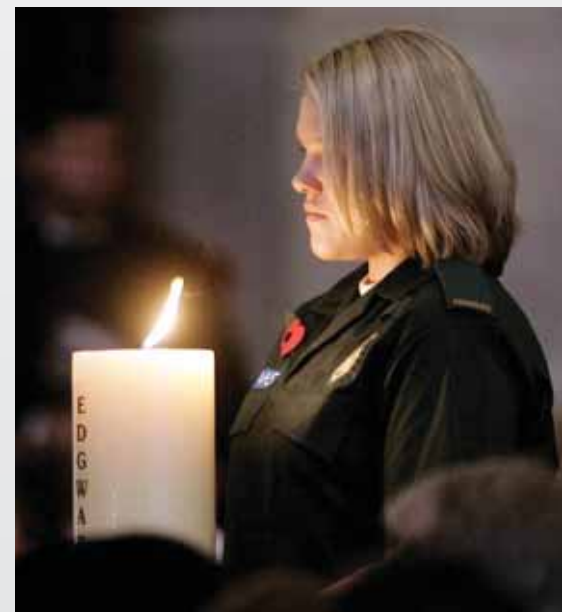
St Paul's Cathedral memorial service

have developed a pre-determined list of resources that states that a minimum of 20 ambulances must be sent to a scene once a major incident is declared. So, even if there were communications difficulties, sufficient numbers of staff will be available to carry out effective assessment and treatment of patients while better links with the control room are being established.