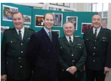
HRH Prince Edward visited Greenwich station

The Health and Safety Executive (HSE) has commended our work in the field of health and safety, citing us as a best practice example of an organisation employing good health and safety techniques. Our investment in vehicles with tail-lifts, the employment of a full-time Ergonomic Back Care Advisor and our introduction of conflict resolution training and stab vests for all A&E operational staff