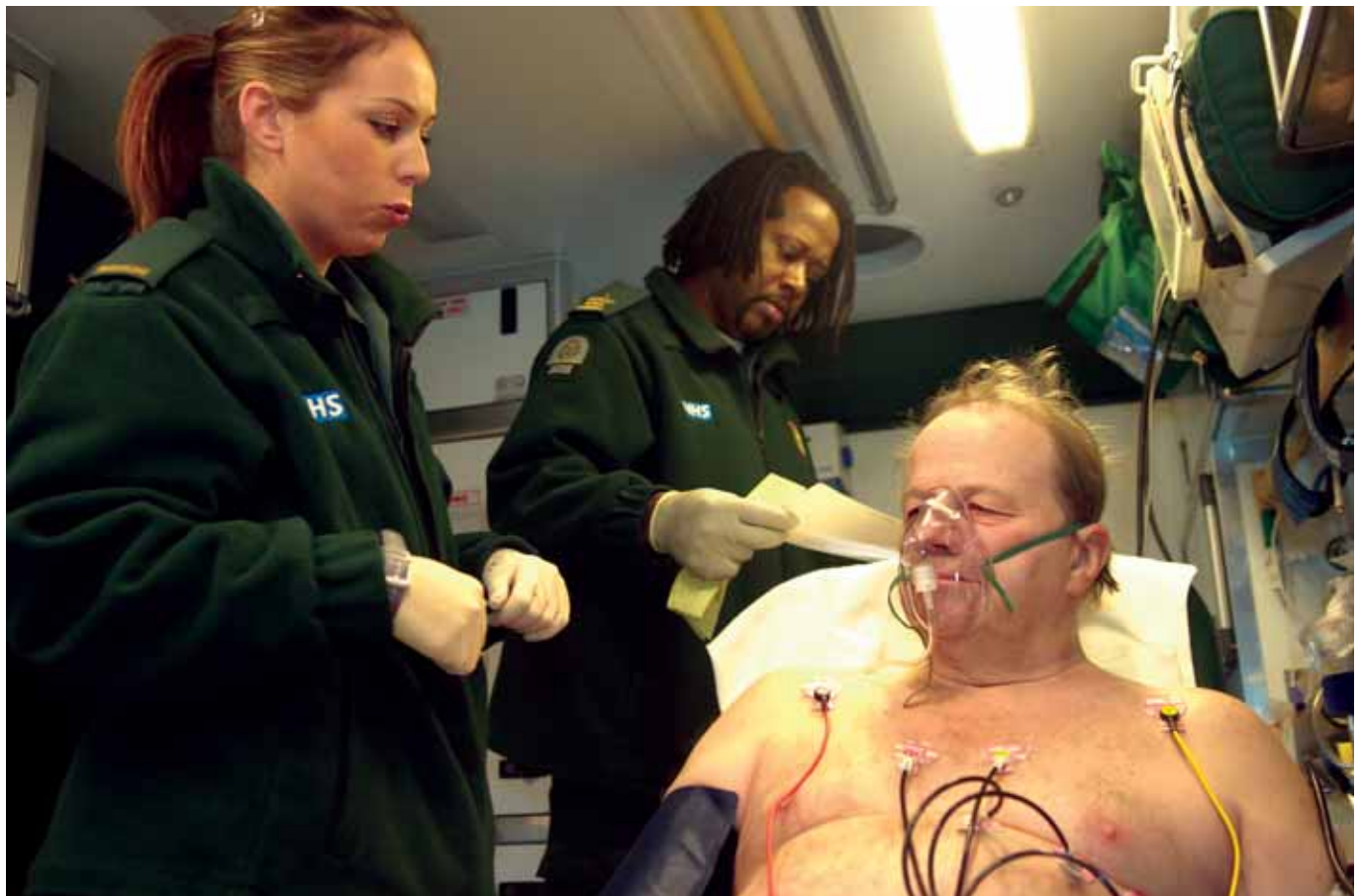
We have continued to develop the care given to cardiac patients

Other cardiac work has been conducted by our Community Defibrillation Officer, who has co-ordinated the installation of 120 defibrillators in public places across the capital and has trained 1,900 people in the use of the devices and in providing Cardio-Pulmonary Resuscitation (CPR). In total,