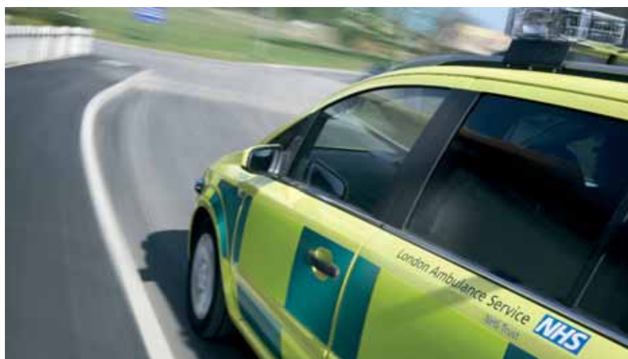
29 new fast response cars hit the road across the capital