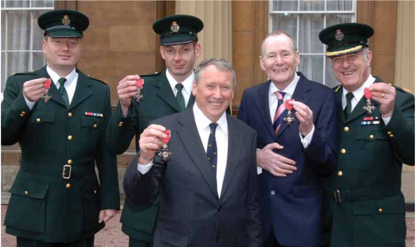
Five members of staff received MBEs

Last year, the Trust's Violence Prevention and Security Manager supported 12 successful prosecutions, with sentences ranging from custodial sentences to community service depending on the nature of the attack. In addition, it is possible that there were other prosecutions where the member of staff liaised directly with the police and did not involve our Violence Prevention and Security Manager.