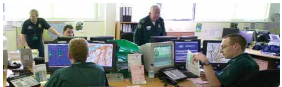
Our new Urgent Operations Centre

The management of the ECP scheme has also been developed with the appointment of a Programme Manager, an Assistant Medical Director and two clinical leads.