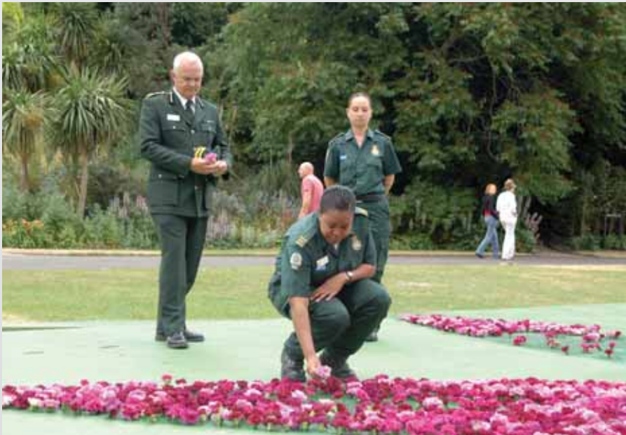
Floral tribute at Regent's Park

We held our own commemorative event in July this year to show our appreciation to all our staff.