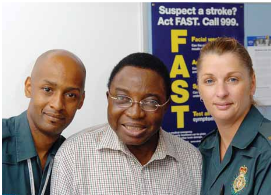
We are working more closely with hospitals to provide the best care for patients who have suffered strokes

We have continued our work with the pupil mentoring scheme and have 23 members of staff trained in providing