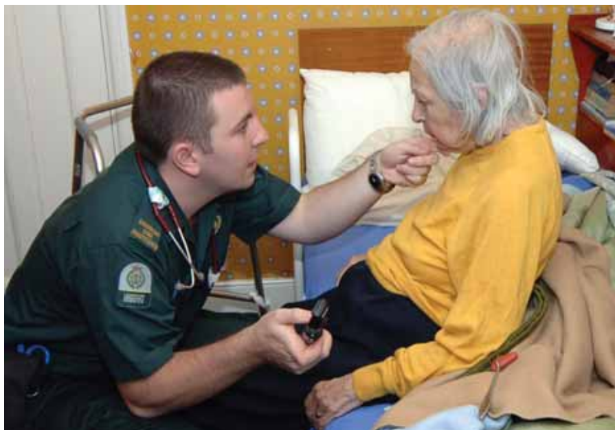
Our emergency care practitioners can treat patients at home

which is both quicker and safer than our previous system. Feedback from advisors involved in an evaluation of the product has been very positive.