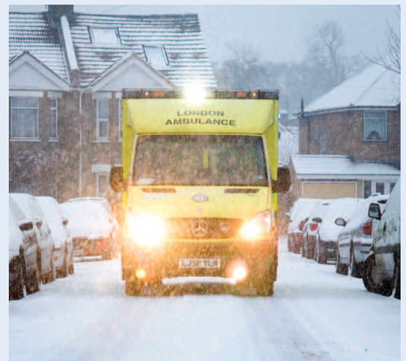
Cold conditions: Bad winter weather led to a rise in 999 calls

However, the Service did fall short of the standard for reaching patients in a serious but not life-threatening