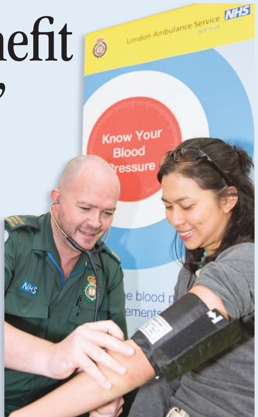
Checked out: A blood pressure event at Waterloo station

High blood pressure is the biggest risk factor for causing a stroke and in April 2010, almost 2,200 people were given free blood pressure checks as part of the Service's biggest ever health promotion initiative.