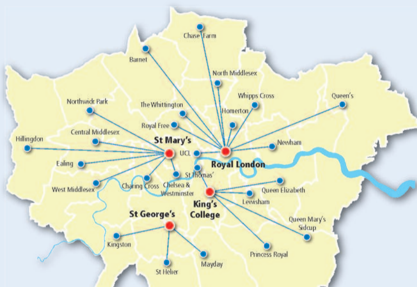
Trauma network: The four major trauma centres and supporting hospitals