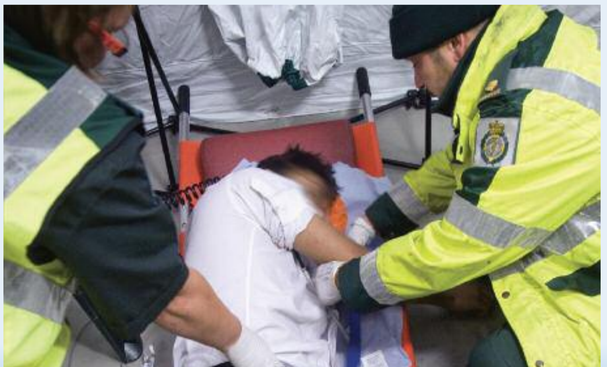
Staff treating a patient suffering the effects of alcohol

Dedicated vehicles – known as 'booze buses' – have been introduced to central London to deal with the increasing number of alcohol-related calls. Treatment centres have also been set up at busy points during the year such as Christmas and New Year.